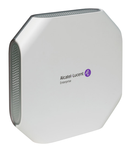
OmniAccess Stellar AP1201 indoor Wi-Fi access point