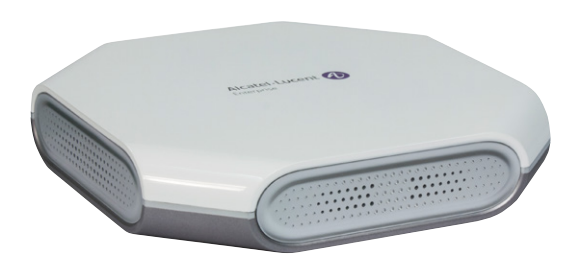
OmniAccess Stellar AP1231 indoor Wi-Fi access point

While digital plays a huge role in enabling better patient outcomes, it also puts a considerable strain on your network. Not only in the volume of data and network traffic, but also in the number of connections that collectively pose a potential security risk. Evidence of this is the recent WannaCry global ransomware attack, affecting around a fifth of Healthcare Trusts in the UK and compromising dozens of systems.